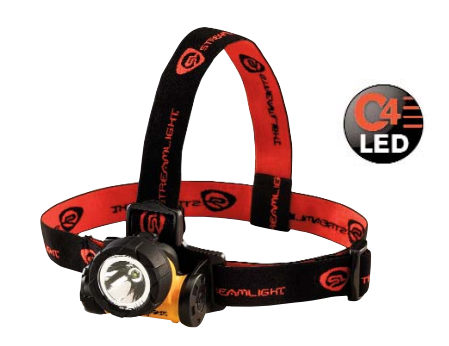
Far-reaching beam illuminates objects at a distance

Case Material: Tough ABS thermoplastic construction with elastomer over mold; polycarbonate lens