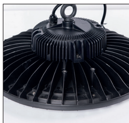
Die-casting aluminium for heat dissipation