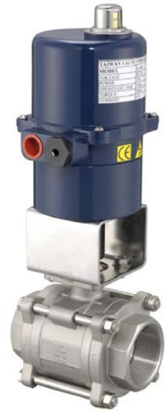
Electric Valve for 922