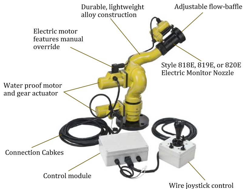
Style 922 (Yellow) monitor shown with standard accessories: Electric nozzle, control module, connection cables, cable joystick control