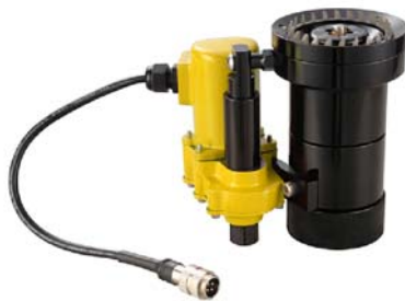
820E Electric Nozzle