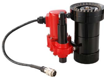
820E Electric Nozzle