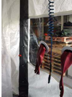
Window with gloves optional