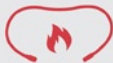
2. Fire Breakout