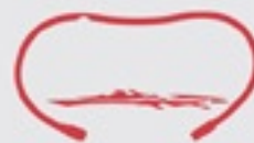
5. Fire Quenched