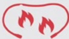
3. Fire Detection