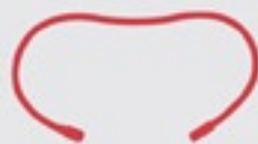
1. System Installed

The BlazeCut system is designed for protection of small enclosures with greater risk of fire. BlazeCut operates automatically without any power supply by detecting higher temperatures. When the temperature in the protected enclosure rises to a critical threshold, the heat sensitive BlazeCut Tube melts down at the point where the affecting temperature is the highest. Melting the BlazeCut Tube creates a hole releasing the entire extinguishing agent stored in the BlazeCut Tube directly onto the source of the fire.