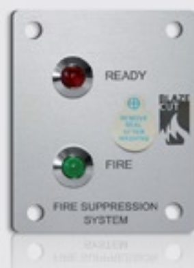
Signaling Unit BC016