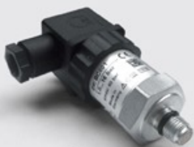
Pressure Switch BC001