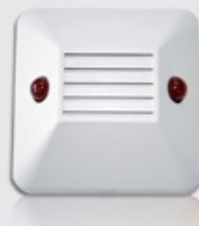
Signaling Unit BC004

Connected to the fitting of the system, the pressure switch monitors the pressure and sends a signal in case the pressure drops under pre-set value.