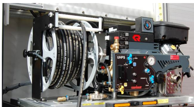
Example of installation