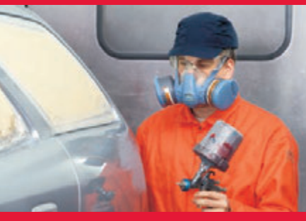
NEGATIVE PRESSURE RANGE

The Scott Pro2000 canister filter range offers a wide choice of filters for specific respiratory challenges, providing high quality and cost efficient protection. Highest specification filter media and materials ensure durability and reliability in the most demanding applications. Details on pages 10 and 11.