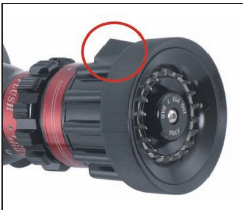
Raised lug for flashover fog pattern