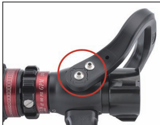
Newly improved handle with two reinforced pieces on each side to prevent breakage