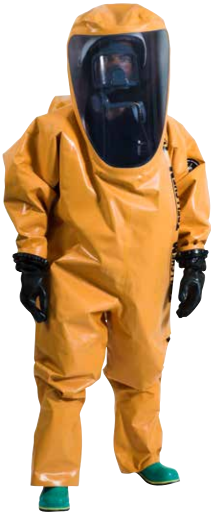
Type VP1 with sewn-in socks/booties and separate boots.

Provides maximum protection against hazardous chemicals in liquid, vapor, gaseous and solid form, including warfare agents. Trellchem® VPS-Flash is fully certified in accordance with the American standard NFPA 1991, including the optional chemical flash fire and liquefied gas protection requirements. The suit is also certified to the European standard EN 943-1 and EN 943-2.