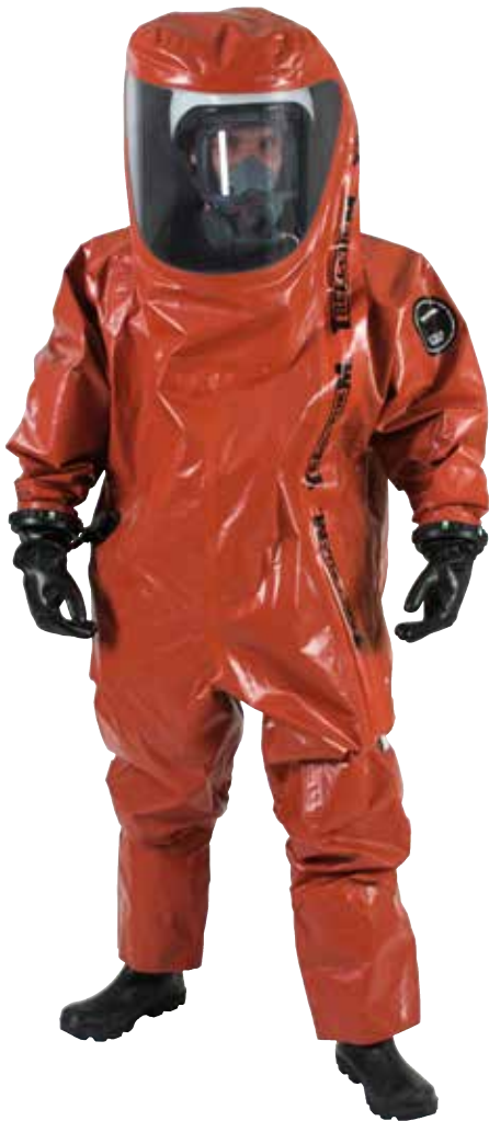
Type CV with sewn-in socks/booties and separate boots.

Trellchem® EVO provides maximum protection against hazardous chemicals in liquid, vapor, gaseous and solid form, including warfare agents. Trellchem® EVO is fully certified in accordance with the American standard NFPA 1991, including the optional chemical flash fire and liquefied gas protection requirements.