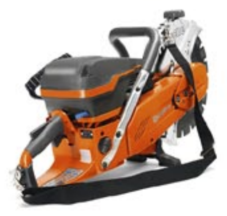
Optimal ergonomics thanks to high power/ weight ratio and low vibration levels. Adjustable carry strap allows full freedom of movement.