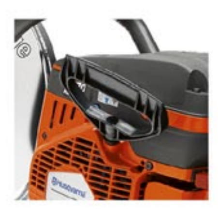
Easy to start thanks to the digital ignition system, fast idle lock in choke lever and specially designed starter handle with room for heavy gloves.