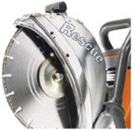
Chromium-plated blade guard, visible in smoke and water spray, enhances control of the cutter.