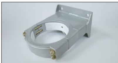
Upper Mounting Bracket