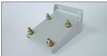
Lower Mounting Bracket