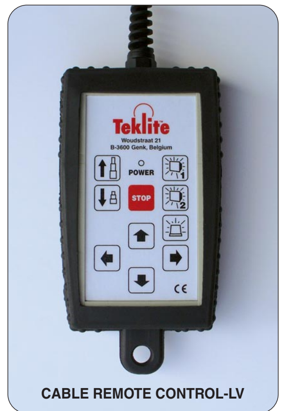
CABLE REMOTE CONTROL-LV