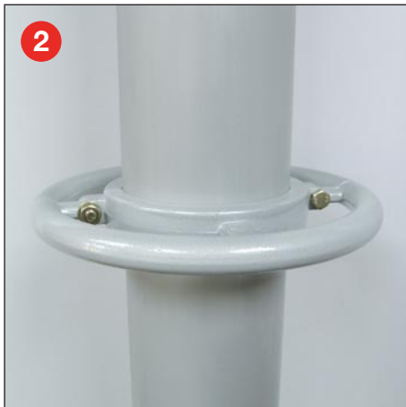
2 Standard natural clear anodised seamless drawn aluminium mast sections with 114 mm base tube and mast rotation handle