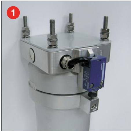
1 Mast top assembly with 4 x PG13,5 cable gland fitted to keyed mast sections