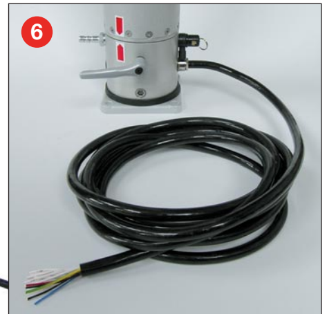
6 Power supply cable (5 metres) with numbered wires for lamp/beacon connection