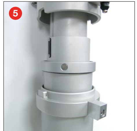
5 Mast top shroud to protect the keyed mast sections