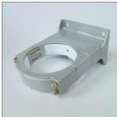
Upper Mounting Bracket