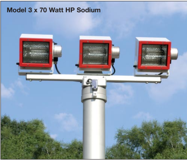
Model 3 x 70 Watt HP Sodium