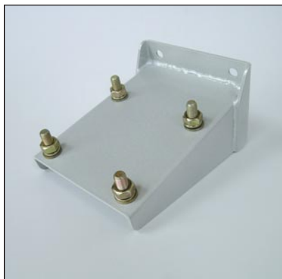
Lower Mounting Bracket