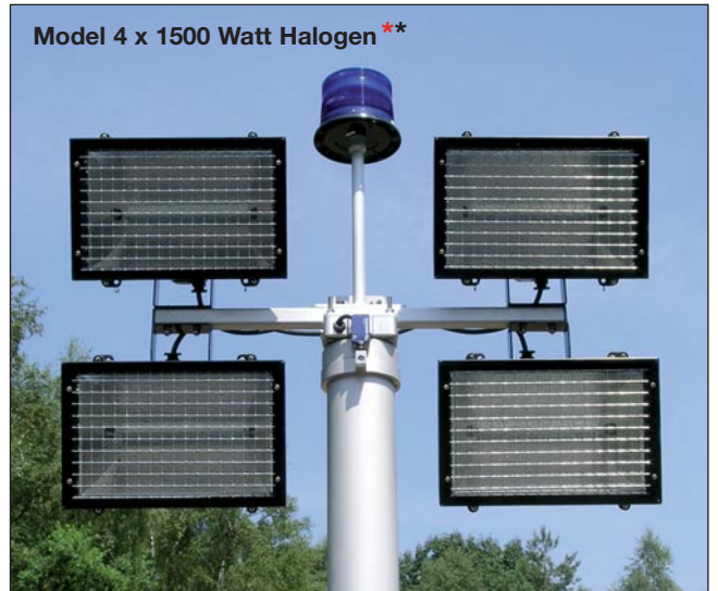
Model 4 x 1500 Watt Halogen**