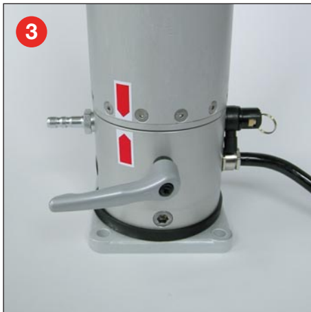
3 360° turnable cardan mast base with air connection, overpressure/drain valve and rotation brake