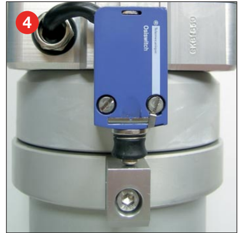
4 Standard pre-mounted and connected warning switch