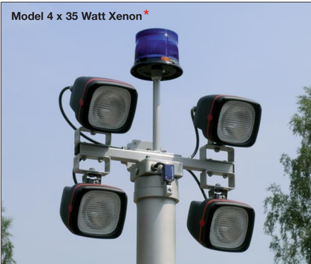
Model 4 x 35 Watt Xenon*