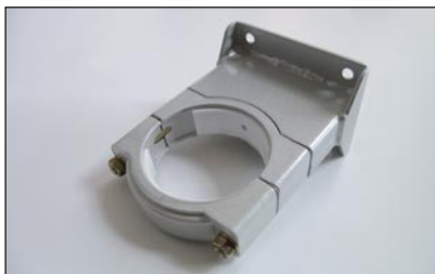
Upper Mounting Bracket