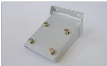
Lower Mounting Bracket